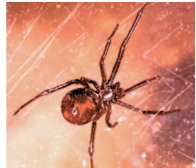
Figure 5. Black widow spider.

A female widow spider's body is about \frac{1}{2} to \frac{5}{16} inch long, with a large, bulbous, shiny, black abdomen marked with red. The black widow has a distinct red hourglass-shaped spot on the underside of the abdomen and usually a red spot just above her spinnerets, which are short, finger-like pro-