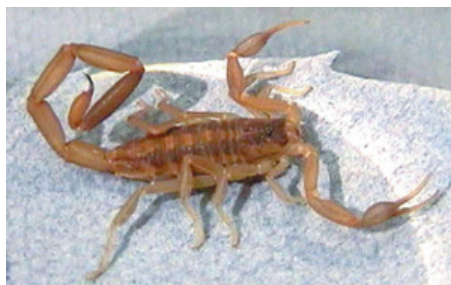
Figure 6. Centruroides vittatus , a scorpion common in Kansas.

Scorpions are long and the body ends in a narrow, tail-like structure with a curved stinger (Figure 6). The stinger delivers neurotoxic venom to paralyze larger prey. The front pair of a scorpion's appendages are enlarged and equipped with pincers, similar to those of a crab or crayfish, which are used to hold prey for stinging and feeding. Scorpions also sting in self-defense.