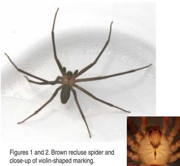
Figures 1 and 2. Brown recluse spider and close-up of violin-shaped marking.

The brown recluse spider ( Loxosceles reclusa ) (Figure 1) is the most abundant poisonous spider of public health importance in Kansas. A bite of this spider in some cases can cause a necrotic lesion where the skin and flesh around the bite break down. This creates an open sore for several days and often leaves a scarred pit that is typically 1/2 inch in diameter. In a very small number of cases, poison from a brown recluse causes life-threatening systemic illness involving various internal organs.